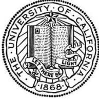
THE UNIVERSITY OF CALIFORNIA